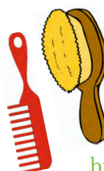
brush and comb